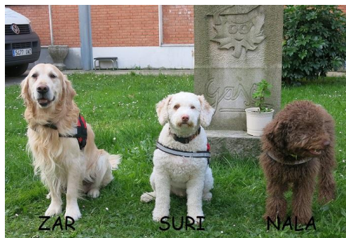
The dogs (Zar - Golden Retriever; Suri and Nala - Water Dogs)