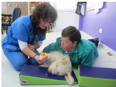
(Example of speech therapy session with a student with Down's syndrome)